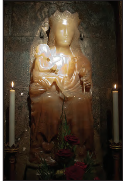
Our Lady of Pew, Westminster Abbey