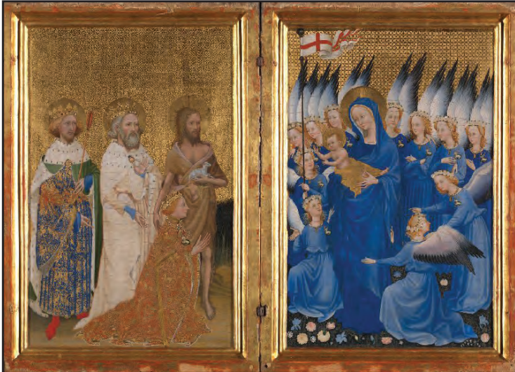
The Wilton Diptych, 1395, The National Gallery, London