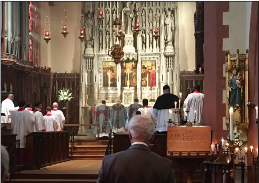
American Region Annual Mass at All Saints, Ashmont, Boston MA, Saturday May 6, 2017

We thus find ourselves called to what might be called an “accidental ecumenism.” Unlike societies founded explicitly for ecumenical purposes, we have more or less stumbled into this vocation. And unlike ecumenical venues