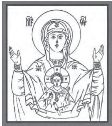
Mary, Ark of The Covenant St. Mark's Ward of The Society of Mary

Some members and other parishioners find it more suitable to their schedules to meet and pray the Rosary on Sunday morning prior to the High Mass.