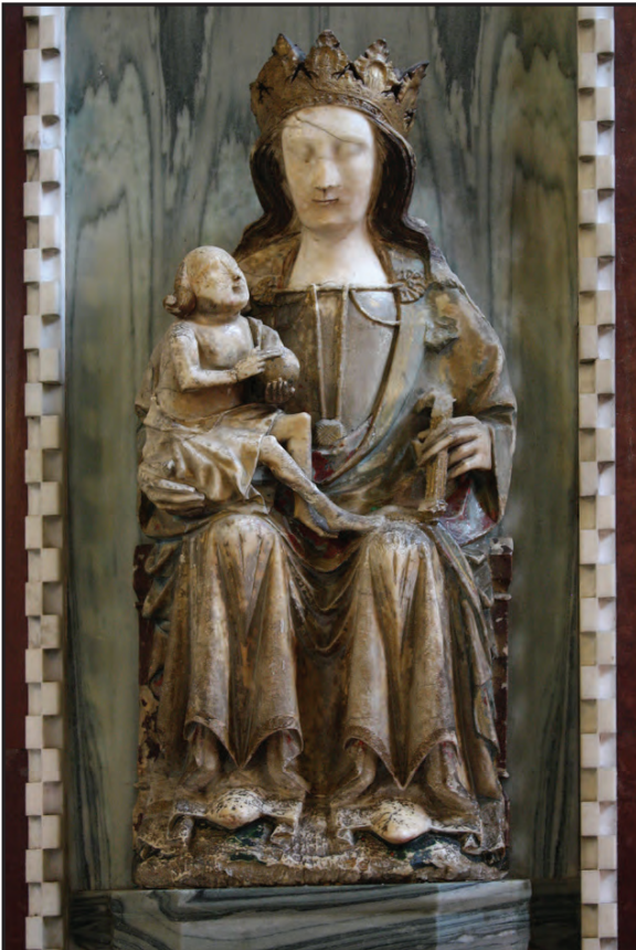
Left: Our Lady of Westminster, Westminster Cathedral, London