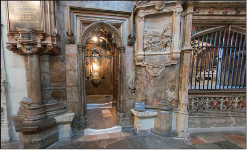
Above: Another view of Our Lady of Pew