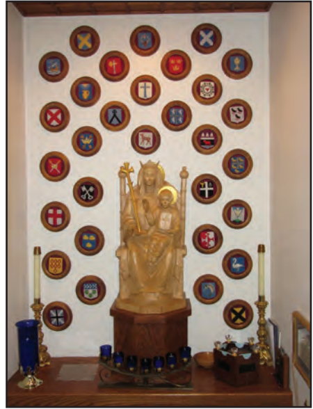
Above: Walsingham Shrine, St. Michael and All Angels, Denver, CO.