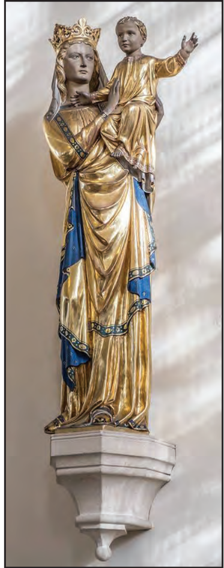
Statue in St. Mary's Cathedral, Derby, England

In the New Testament, we see the dawning of the new creation, “... and the Word became flesh and dwelt among us.” (John 1:14) However, this would not be possible if it were not for a simple fiat , a simple, “Yes” from a young virgin, Mary most holy. God in his infinite wisdom permitted a human being to play an integral role in the redemption of the world. God chose a woman to participate in his act